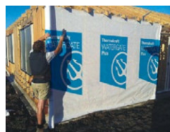
Fix securely to the frame with fasteners such as 6-8mm staples