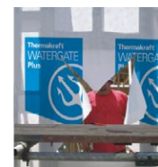
On arrival of doors and windows, cut Watergate at each opening on a 45° angle away from each corner. Pull the Watergate flaps inside and fasten to the inside of frame.